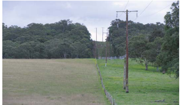
Image: Existing Kurri to Stroud Road powerline

This project is part of a larger reinforcement plan to the Lower Mid-North Coast and Newcastle which includes constructing 6km of 132,000 and 330,000 volt transmission lines between TransGrid's new Tomago Substation and Tarro.