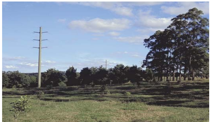
Image: An example of a typical pole structure which may be used in the proposed upgrade