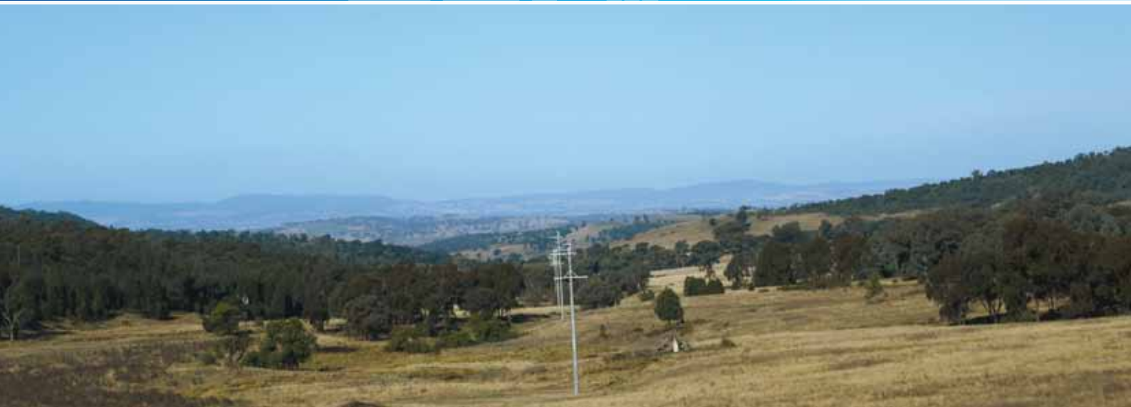
Above: Concrete poles for the new transmission line between Manildra and Parkes.