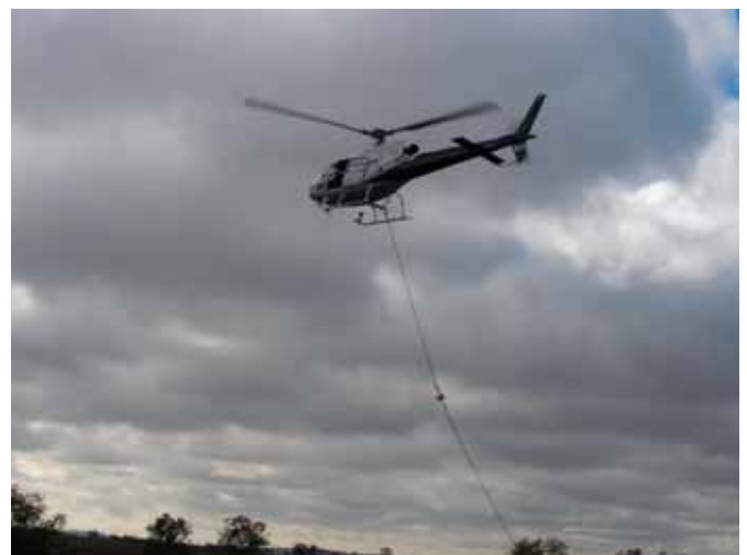
Above: Helicopters will be used in August for the stringing of electrical wires on the new transmission line.