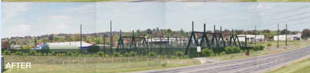
View of the proposed switching station from Leeds Parade