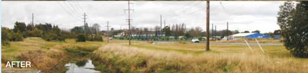
View of the proposed switching station and transmission lines from Dalton Street