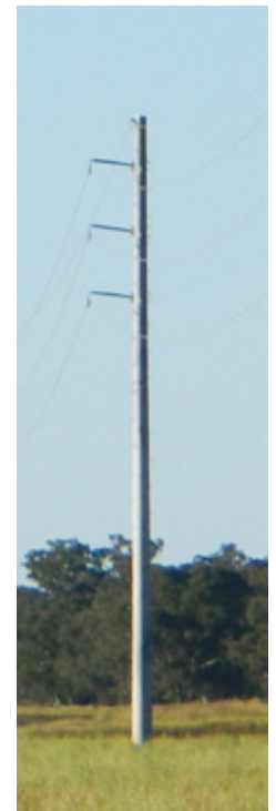
Above: The existing 132 kV steel structure is being dismantled in the coming months to make way for new concrete poles similar to the sample pole shown in the above image to the right.