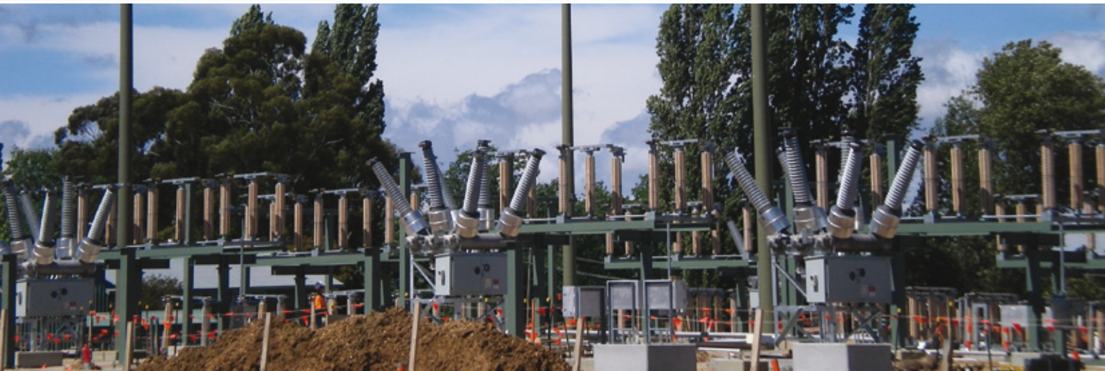
Above: The new switching station is scheduled for completion early 2012.