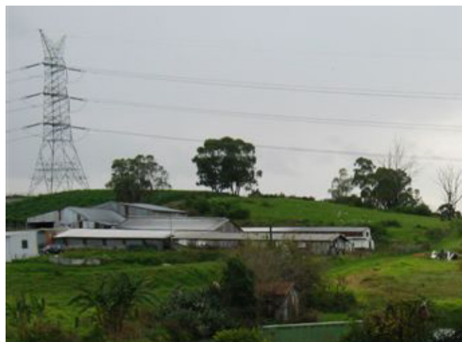
Above: TransGrid has been working with property owners along the transmission line corridor to secure an easement for the line to be upgraded from 132 kV to 330 kV.