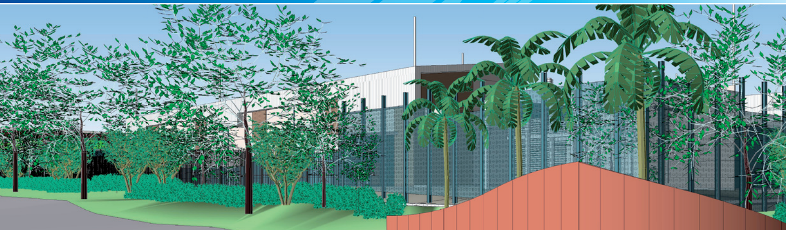
Conceptual view of TransGrid's new substation at Potts Hill from Rookwood Road.