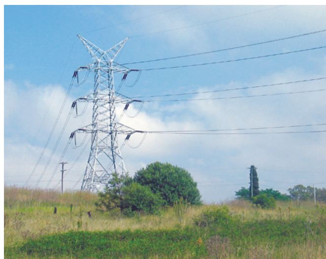
Right image: The voltage of the 132 kV transmission line between Sydney West Substation and the new Holroyd Substation is being upgraded to operate at 330 kV.