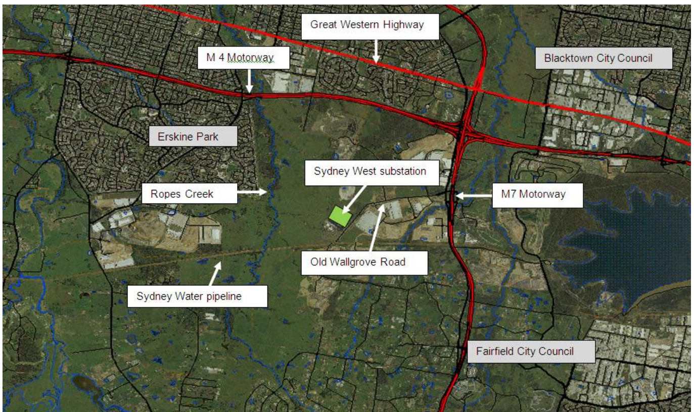
Figure 1: Transgrid's Sydney West Substation

Transgrid's Senior Environment and Sustainability Manager is ultimately responsible for preparing, keeping, testing and implementation of the PIRMP.