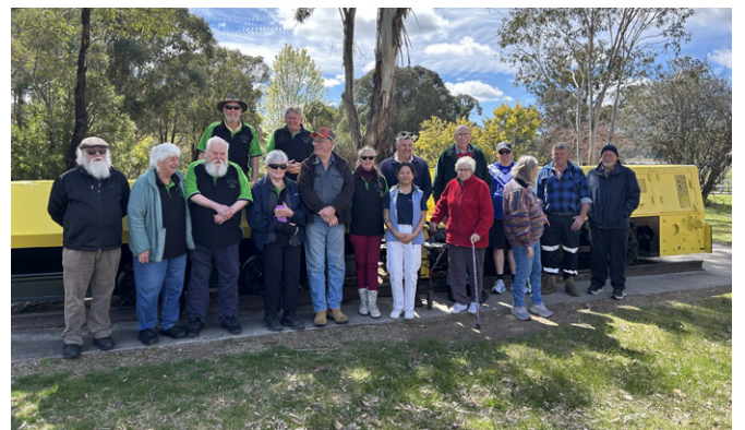
Image 5: Representatives from the Wallerawang Lidsdale Progress Association, Lithgow City Council, members of the community and Transgrid in front of the restored mine transporter.