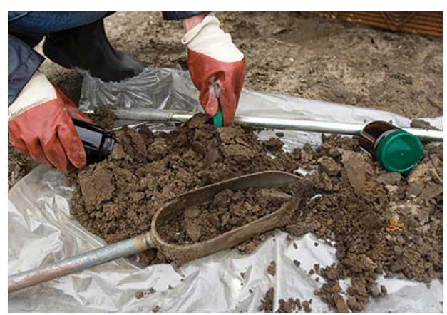
Pictured: Soil analysis on-site.

The assessment included a review of existing conditions, identification of potential impacts on soil, geology and contamination as a result of the construction and operation of the project, and how we propose to manage these impacts.