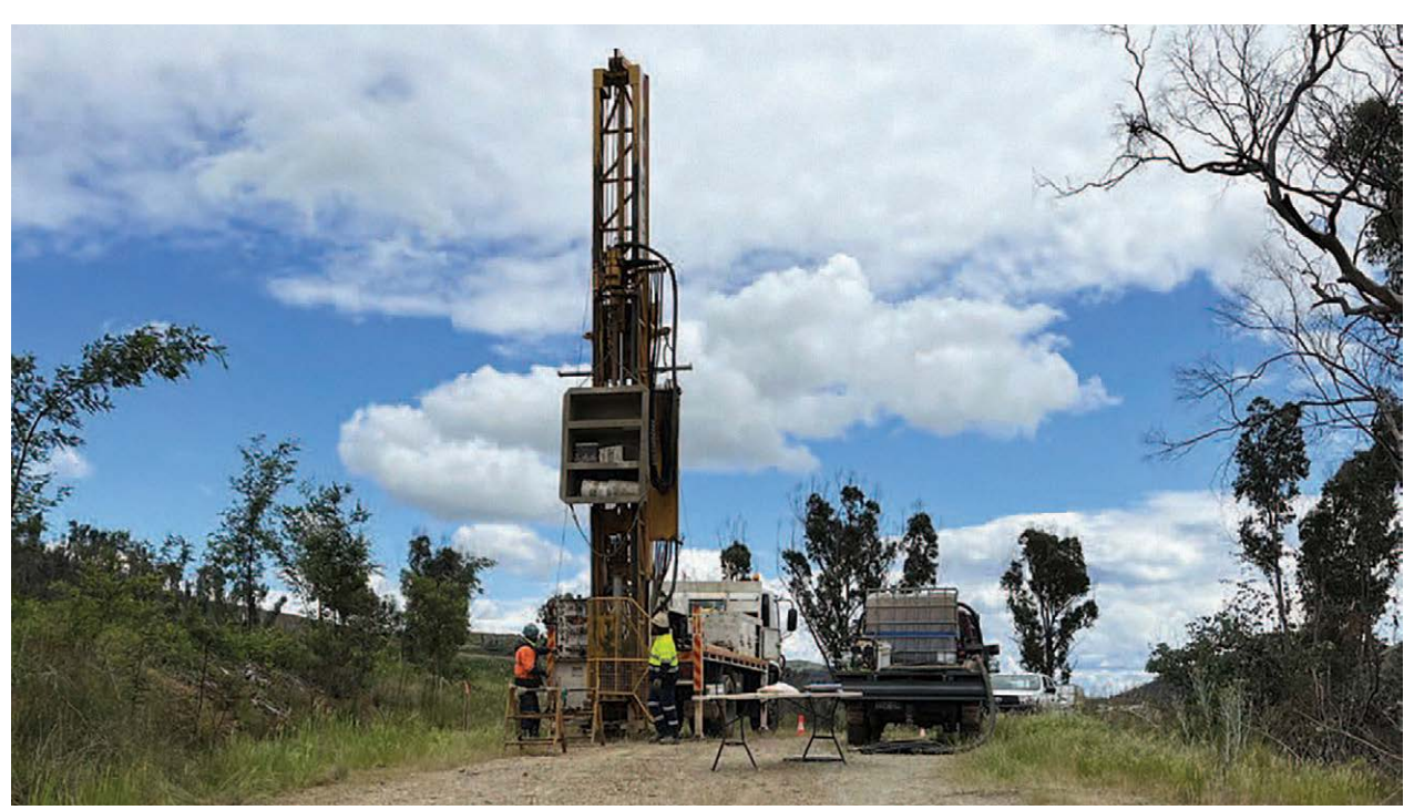
Pictured: Truck mounted drill rig collecting soil and rock samples on site.

An additional desktop study was completed with the buffer extended to 10 kilometres to consider the NSW Government per-and-poly-fluorinated alkyl substances (PFAS) Investigation Program and Department of Deference Unexploded Ordnance (UXO) Program. These contaminants can be persistent and travel long distances however our assessment demonstrated a low impact due to distance from the project footprint.