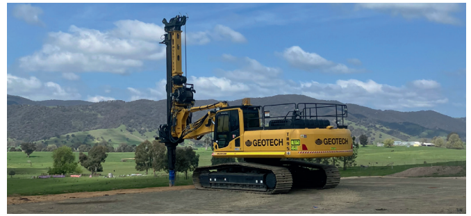
First pile being drilled near Tumut in late September.

As construction activity increases, there will be more HumeLink East vehicles travelling along local roads and near construction sites, and we want to thank the community for their patience while there are increased traffic movements in the area.