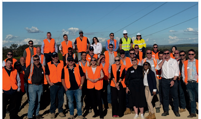
Civil Contractors Federation delegation visiting construction near Yass.

The event provided an excellent opportunity for networking with subcontractors and showcased the strong collaboration between HumeLink East and local industry partners.