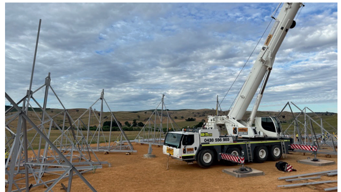
Tower assembly underway at Adjungbilly