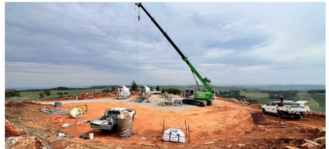
Foundation construction near Adjungbilly.