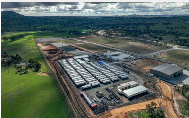
Aerial image of Yass worker accommodation facility (October 2025).

The camp will bring more people into Yass, supporting local shops and businesses while easing pressure on housing and accommodation.