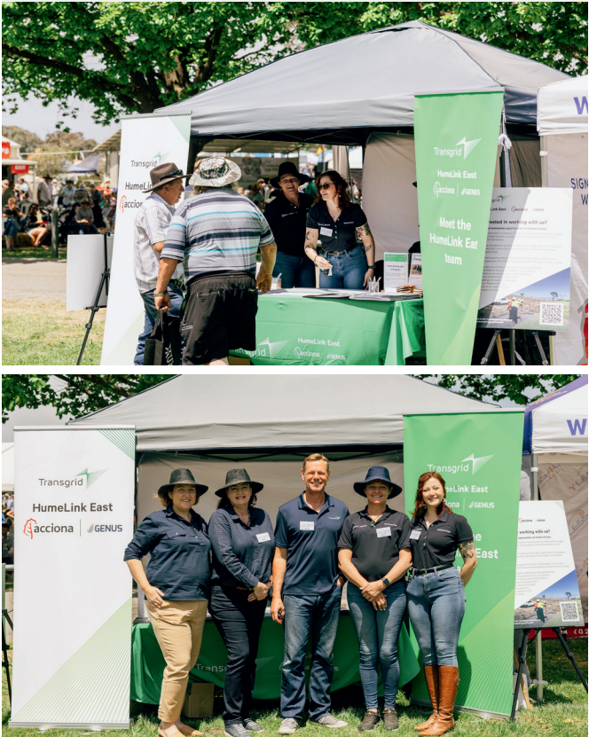
HumeLink East team at Murrumbateman Field Days.

Our community team had a fantastic few days representing the project at the Murrumbateman Field Days on 18-19 October. Nearly 300 people dropped by our stall and it was a pleasure to speak with the community and provide them with an update on how the project is progressing.