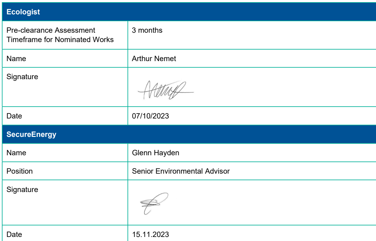
Table 3 – Pre-Clearance Approval