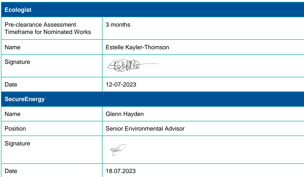
Table 3 – Pre-Clearance Approval

Once printed this document becomes uncontrolled. Refer to Secure Energy Intranet for controlled copy