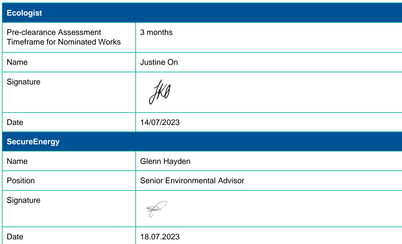
Table 3 – Pre-Clearance Approval

Once printed this document becomes uncontrolled. Refer to Secure Energy Intranet for controlled copy