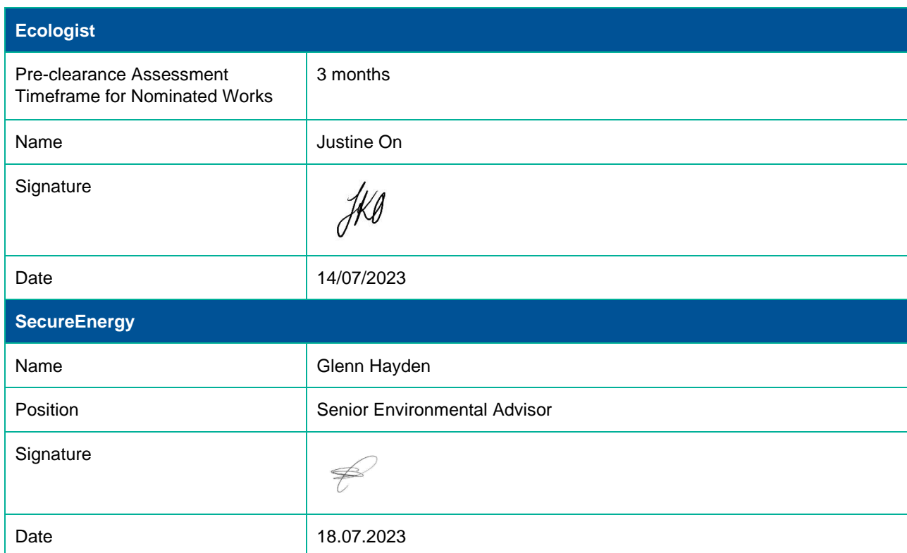
Table 3 – Pre-Clearance Approval

Once printed this document becomes uncontrolled. Refer to Secure Energy Intranet for controlled copy