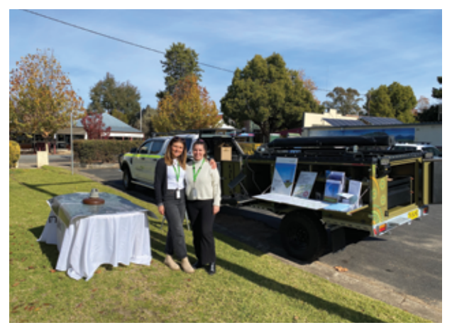
Pictured: The HumeLink project team at the May Community Information Session in Adelong.

If you have not had a visit from us yet, please reach out to the team to request we come and visit your community.