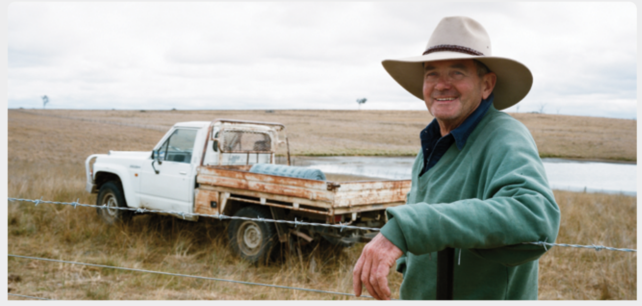
Pictured: Transgrid is working with landowners to develop property management plans specific to each property.

Visit the <u>EIS Frequently Asked Questions</u> on our website to learn more about the HumeLink EIS.