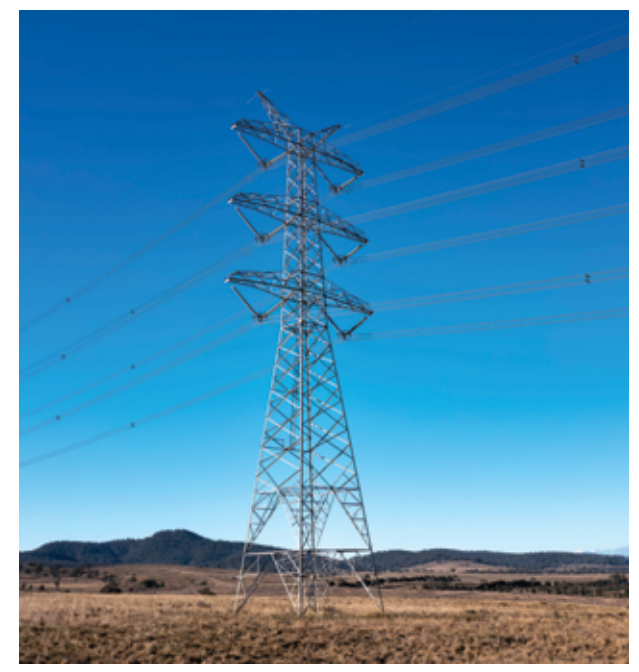
Pictured: Example of a 500 kV transmission tower.

To find out more about HumeLink's transmission towers, including the difference between a suspension and a tension tower, please read the factsheet on the <u>HumeLink website</u>.