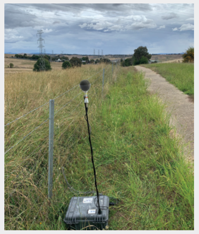
Pictured: Noise logger measuring background noise levels.

You can read more in our noise and vibration impact assessment factsheet and other EIS topics on the <u>HumeLink website</u>.