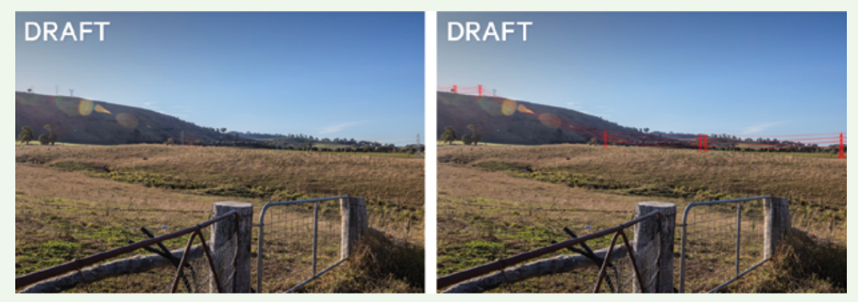
Pictured: Photomontage - view from Yaven Creek (image on the right has towers highlighted in red to help identify them).

To view more photomontages please visit the HumeLink website.