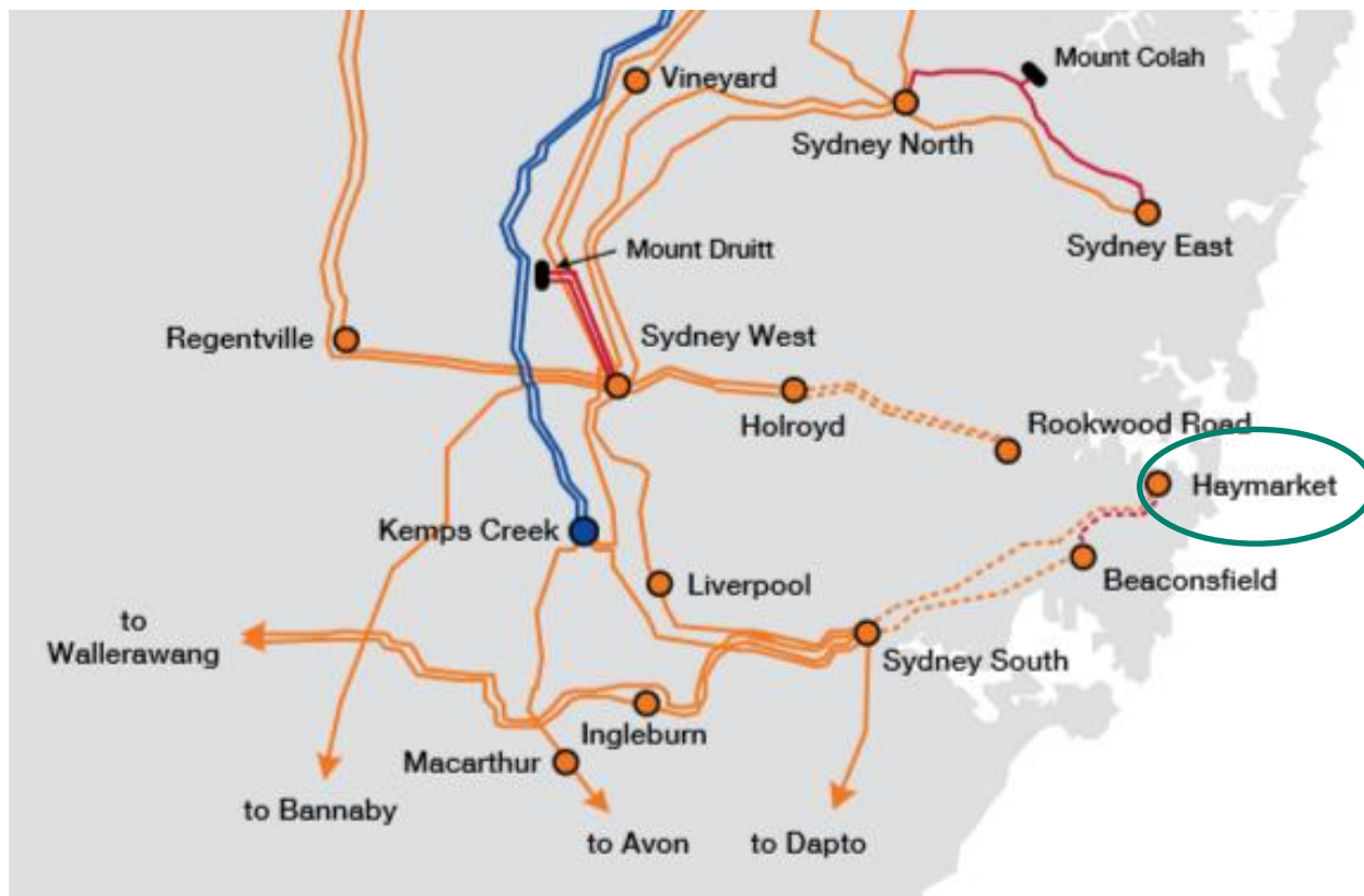
Figure 2-1 – Transmission network supplying Sydney

An overview of the Sydney transmission network is provided in Figure 2-1 below.