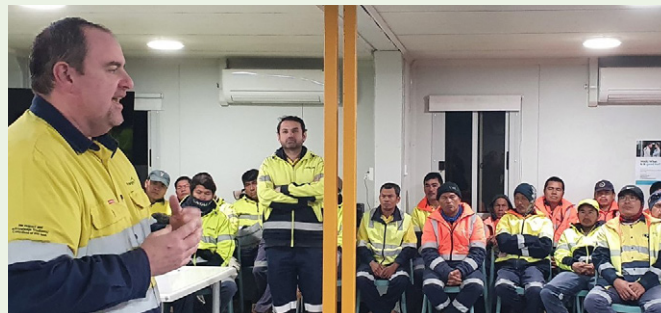
The Community and Stakeholder Engagement team visiting workers at the accommodation camp.

"Essentially we want to be good neighbours and guests whilst we are working in the region and leave a positive legacy for future energy projects."