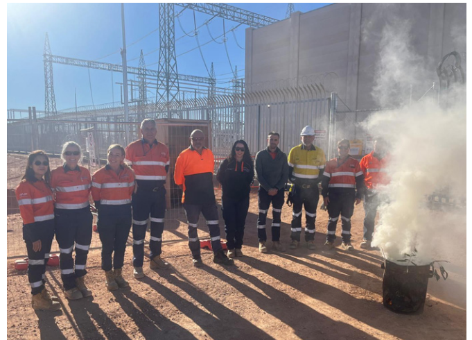
Smoking Ceremony at Buronga Substation