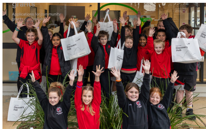
School students at the Discovery Hub as part of the Wiradjuri Program.