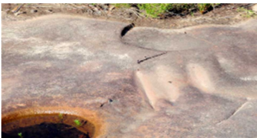
Well and grinding grooves

If suspected human remains are discovered, contact the police.