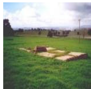
European Heritage ruins