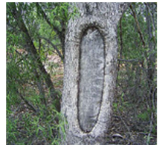
Tree Scar (from bark removal for a shield)