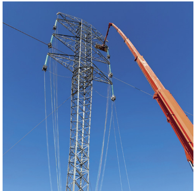
Image 5: Example of a stringing of a 330kV transmission tower from the EnergyConnect (NSW) project.

Following erection and securing of the transmission line structure, the transmission line would be strung by using either a ground pulled draw wire, or through aerial methods such as a helicopter or a line stringing drone (with brake and winch sites). The final methodology for stringing of the transmission lines would be determined during detailed design and construction planning in consultation with the construction contractor(s) and could include a combination of methodologies.