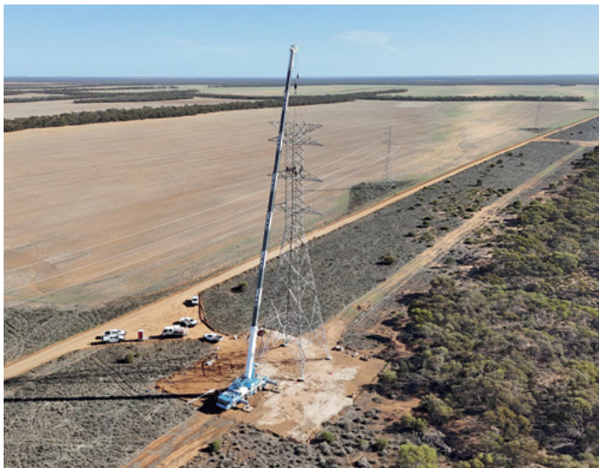
Image 4: Example of a 500kV transmission tower being assembled onsite from the EnergyConnect (NSW) project.