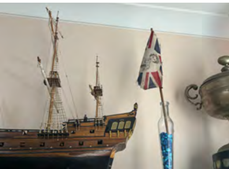
Image: Replica of the Black Pearl Ship and a flag from the 1954 tour of Lithgow by Queen Elizabeth II.

If you would like to learn more about the Lithgow & District Family History Society Inc. and their important work, please visit their Facebook page or to get involved email secretary.ldfhs@gmail.com