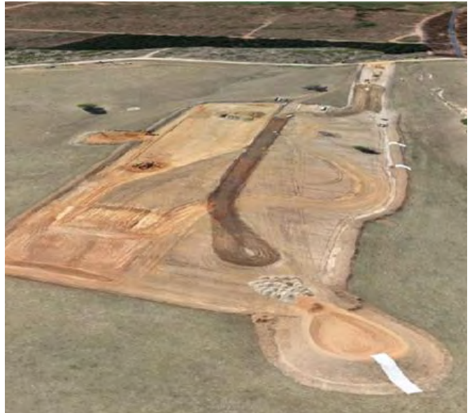
Future Adjungbilly workers' accommodation site from the air

In sub-zero temperatures, the Transgrid, ACCIONA and Genus teams worked collaboratively with the StateGrid Testing Station personnel. In Australia, there is no viable supplier that builds or tests these size towers. Over 13 days, the team analysed data from each of the tests, with all testing completed successfully. With this completed test and submission of records, the team will advance into full scale production of the transmission towers, which will be built in China, needed for HumeLink East.