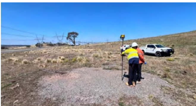
Workers undertaking survey work along the alignment