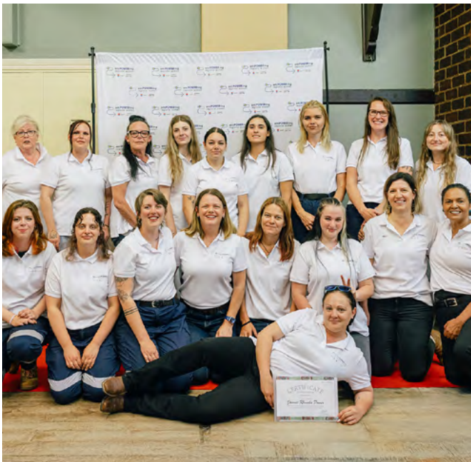
emPOWERing Regional Women pre-employment program graduation

The HumeLink East project is proud to have employed 11 of the participants from the emPOWERing Regional Women pre-employment program.