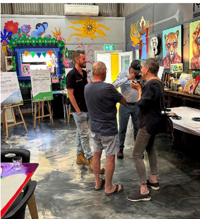
Yass community information drop-in session at Tootsie Gallery Cafe

For more information or to talk to a member of our team, please contact us on 1800 317 367 or community@humelinkeast.com.au