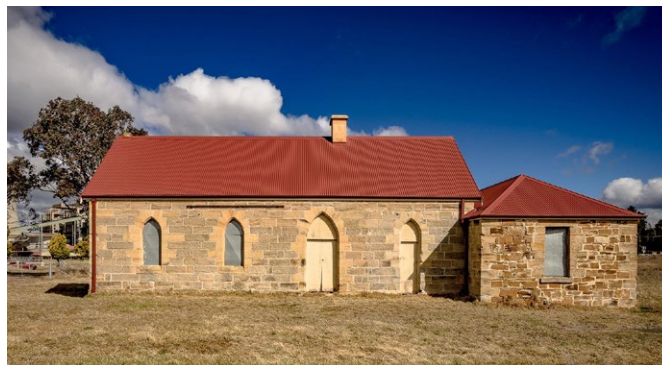
Image: Old Wallerawang School House at Main Street, Wallerawang.

An Unexpected Finds Protocol will be created that will outline the process to follow if any items of potential non-Aboriginal historic heritage significance or human remains are discovered during construction.