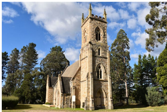
Image: St John the Evangelist Church at Main Street, Wallerawang.

Proposed mitigation - the Project will minimise the use of vibratory equipment for nearby access track upgrades and maintain safe working distances to avoid vibration damage. Care will be taken to reduce construction impacts for access track upgrades near St John the Evangelist Church due to its already fragile condition.