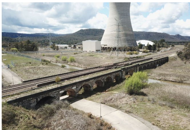
Image: Wallerawang rail bridge.

Proposed mitigation - an alternate access track has been proposed for vehicles that are unable to fit through the sandstone arch to avoid the possibility of damage to the heritage-listed item. The Project does not intend to modify the current access road, therefore, no impact will be made to the heritage significance of the bridge.