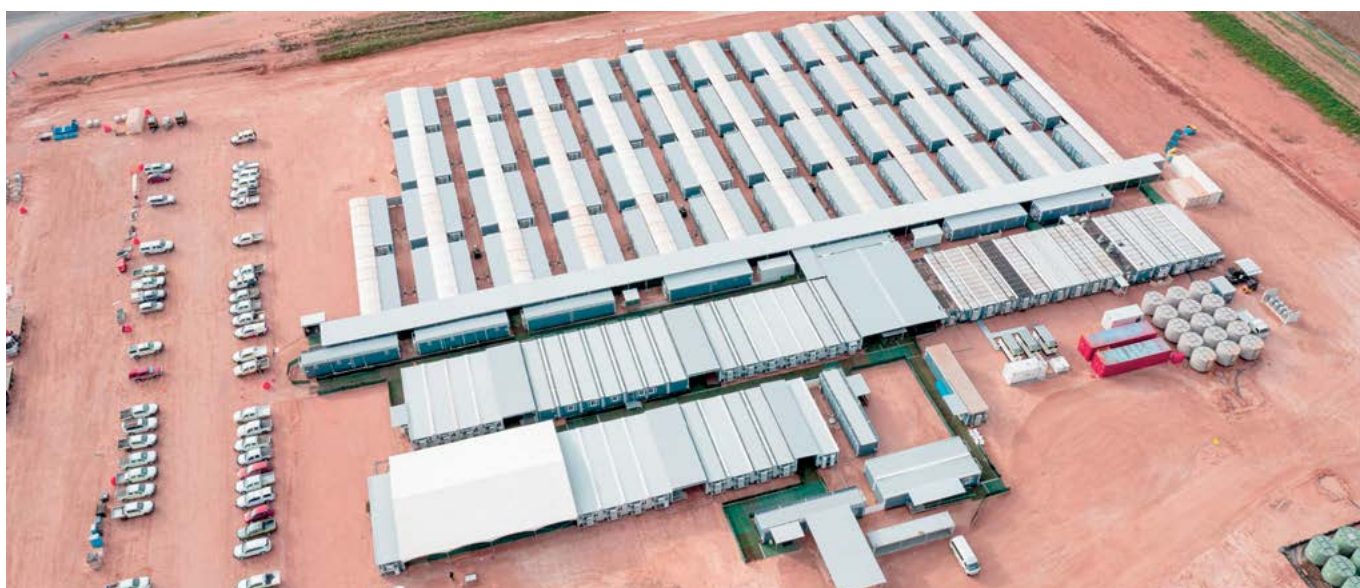
Figure 5: Example of worker accommodation from Project Energy Connect.

The number of expected workers will vary dependent on the construction works stage. The project is anticipated to employ up to 1,600 full-time construction workers across multiple work fronts during the peak of construction activities.