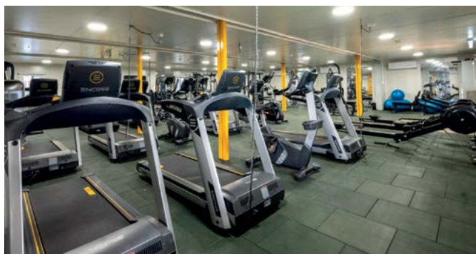
Figure 6: Example of worker accommodation from Project Energy Connect.