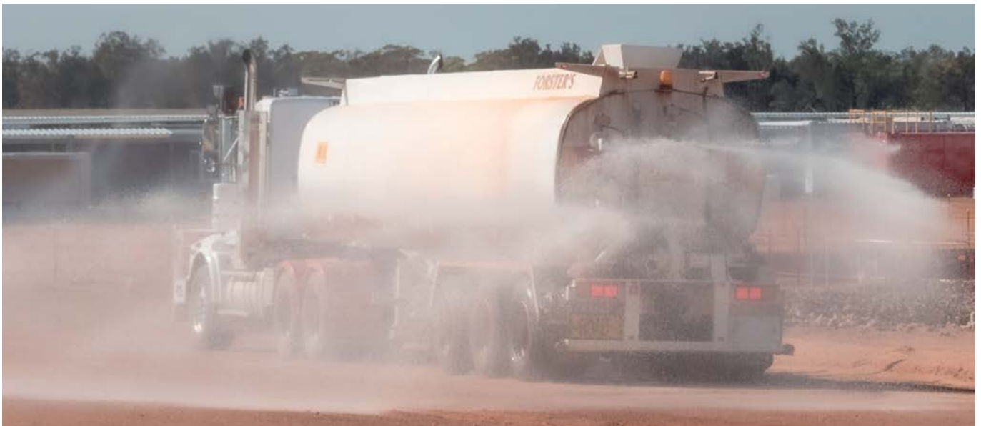
Figure 8: Example of dust suppression with a water cart.