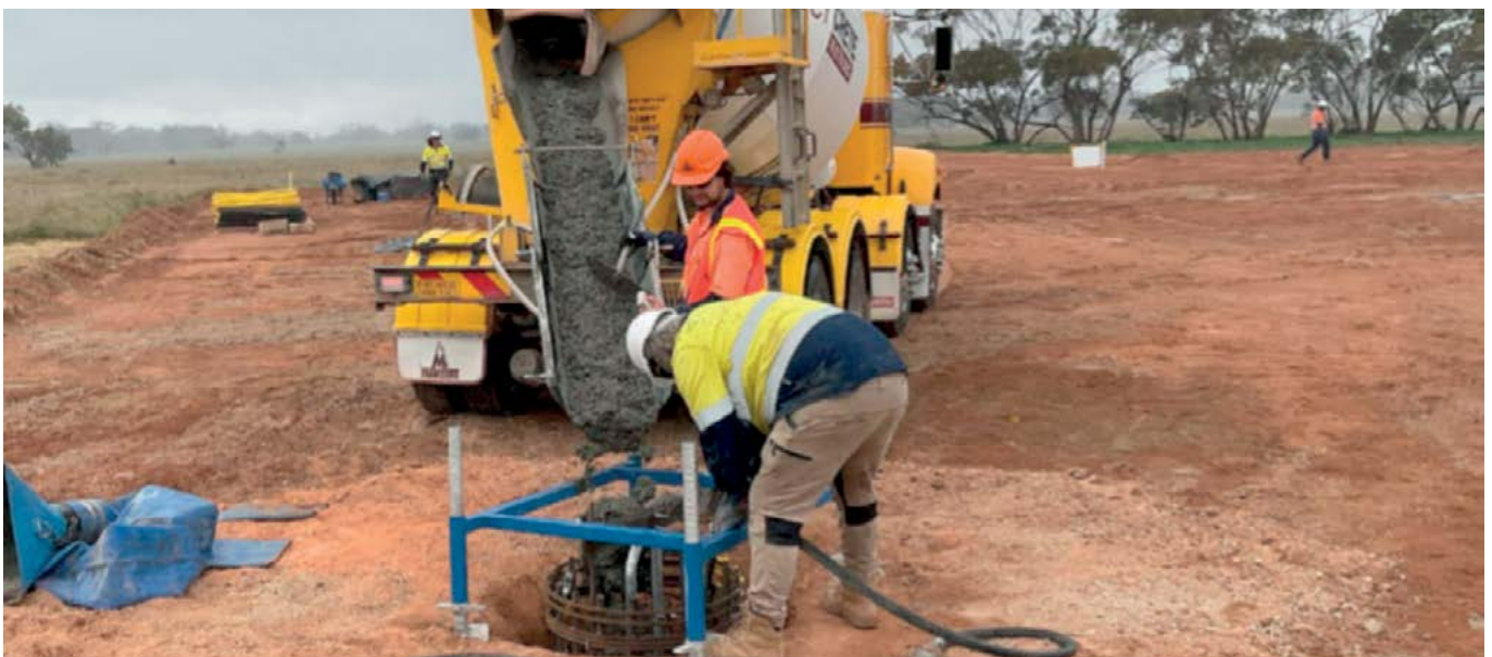
Figure 9: Example of concrete pouring.