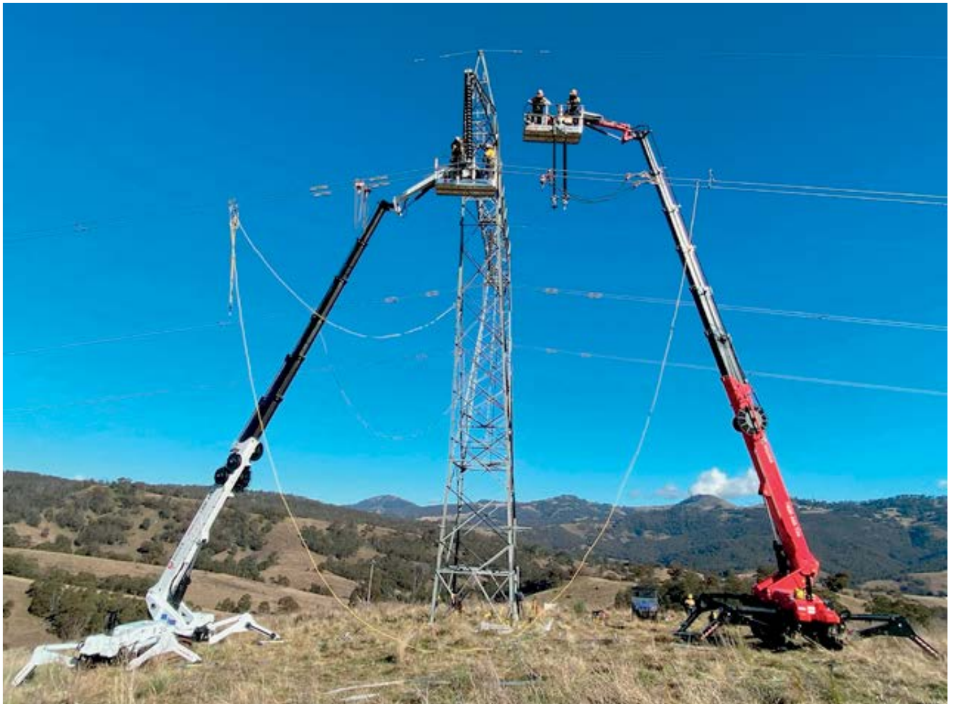
Figure 10: Spider vehicle to assist in transmission line structure construction works.

Individual engagement with impacted landowners is being undertaken.