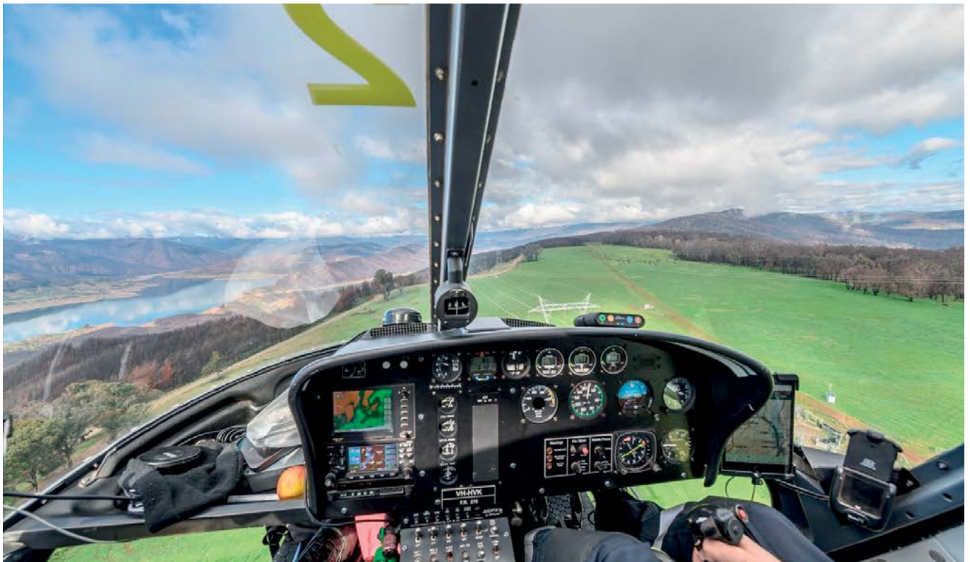
Figure 12: Example of helicopter used for aerial investigations.

Helicopter facilities for take-off and landing will be established as part of the proposed construction compounds. The anticipated flight paths will be to and from the construction compound locations and the proposed transmission line easements.