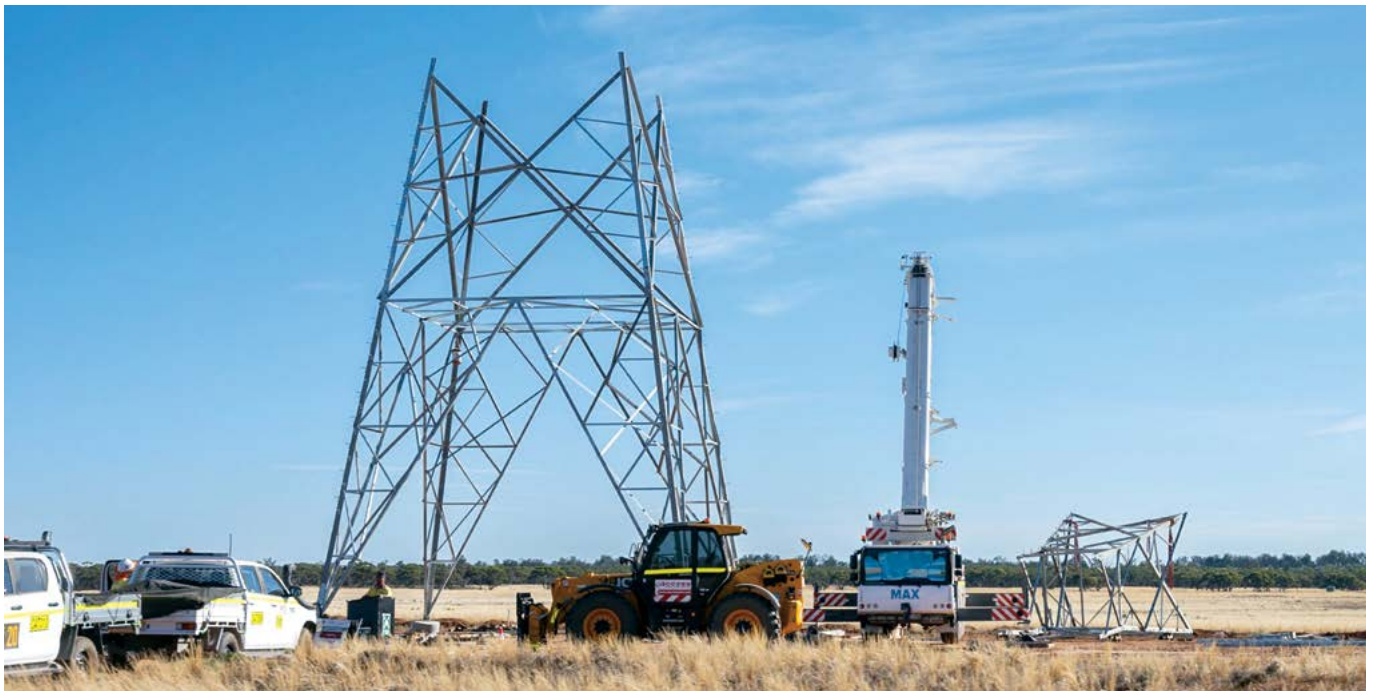
Figure 2: A 500 kV transmission tower being assembled onsite.

Detailed design for HumeLink and the final construction methodology will provide further details of activities to be undertaken during the transmission line construction stages. These details will be developed and finalised by our delivery partners who will communicate additional information in the coming months.