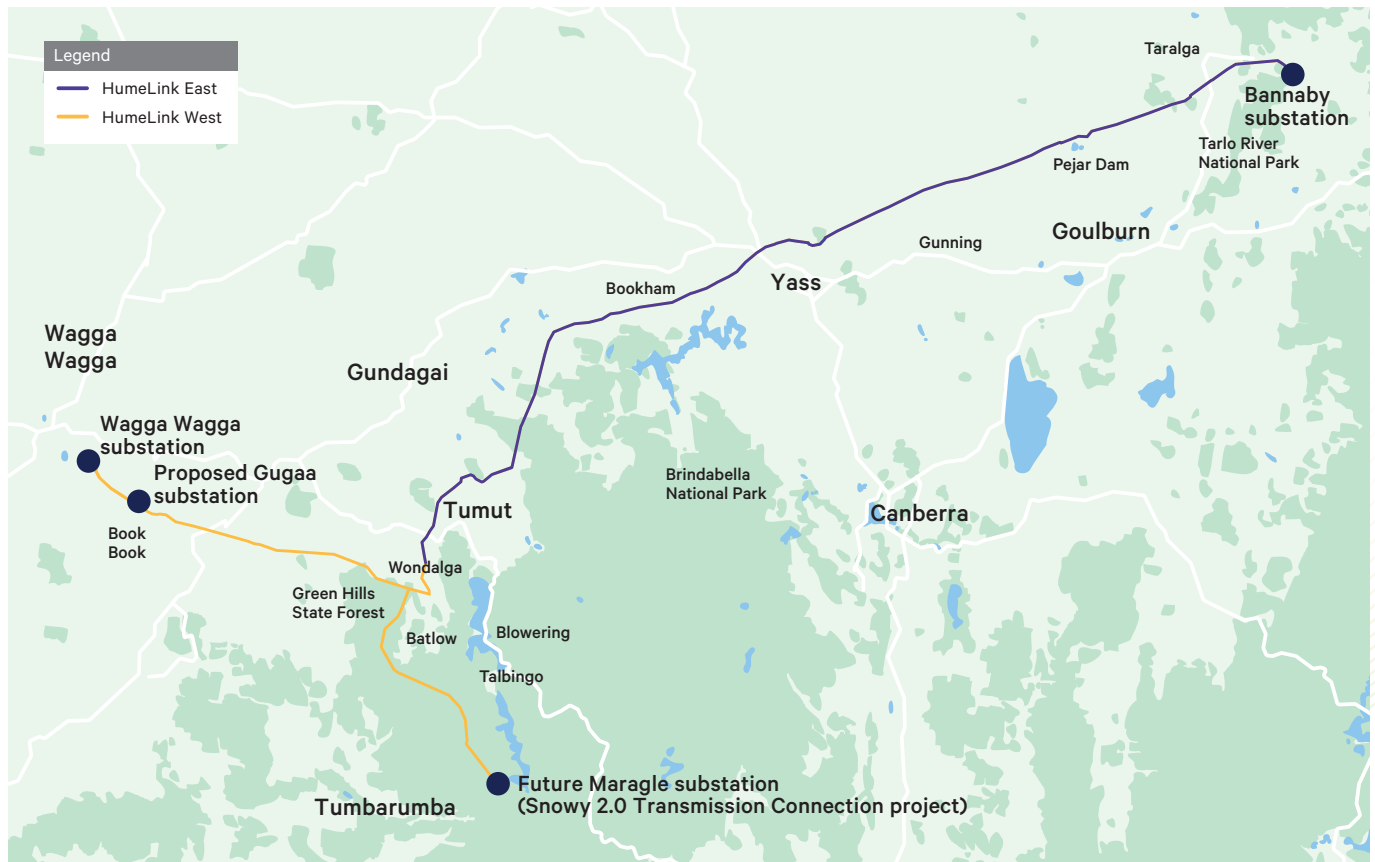
Figure 1: HumeLink East and West map.