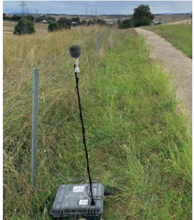
Figure 4: Noise logger used to measure background noise levels.

Instrumentation and monitoring equipment will be installed as part of this stage to record and monitor factors including background noise and dust before, during and after construction. Noise loggers and dust gauges/monitors will be installed at various locations at and near the project footprint.