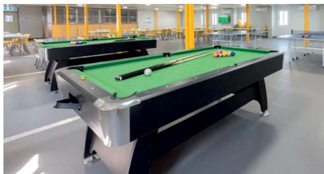
Figure 7: Example of worker accommodation from Project Energy Connect.