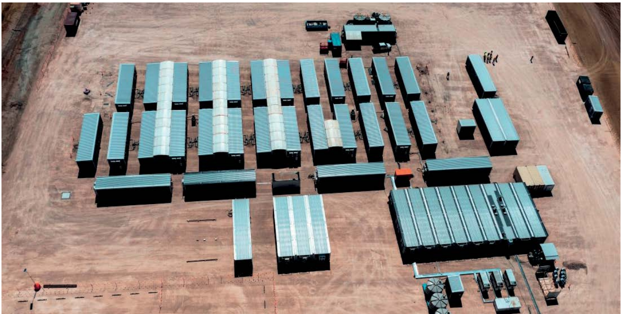
Image: Example of a worker accommodation facility from Project Energy Connect .

The locations of new accommodation facilities will be assessed in the Amendment Report and we will continue to consult with the community and stakeholders on this throughout the assessment.