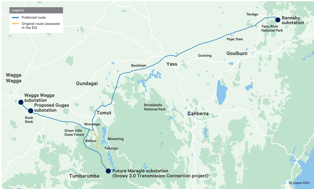
Figure 1: HumeLink preferred route.