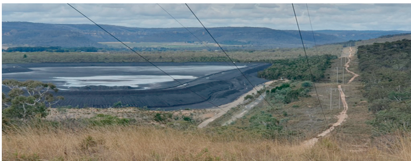
Image: Photo of current 45m easement for 132 kV transmission line. Transgrid is proposing to increase the width of the easement by approximately 15 m to the north (left hand side) to accommodate the new 330 kV transmission line. The 330 kV line would replace the 132 kV line shown above.

The Wallerawang and Mount Piper area (shown in the map overleaf) is located approximately 20 kilometres north-west of Lithgow on the western fringes of the Blue Mountains.