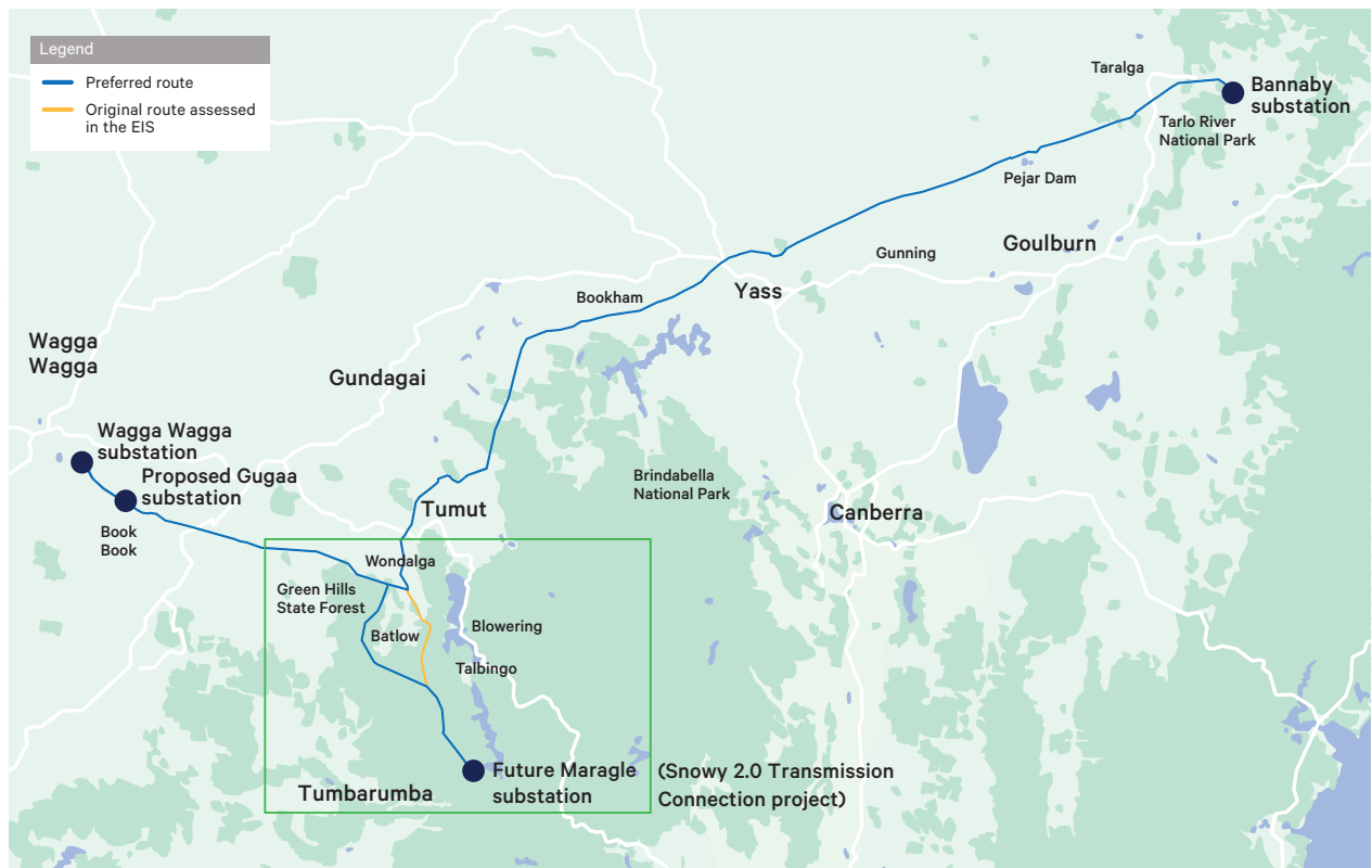
Figure 2: HumeLink preferred route.

View the preferred corridor and provide feedback via our Interactive Map .