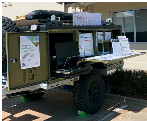
Image: Remote Access Community Hub (RACH) setup in the project area during the EIS exhibition.

If you are unable to join us in-person or online, we have developed a digital EIS which is a user-friendly and interactive platform to present the key outcomes of the EIS. You can view the digital EIS on the HumeLink website .