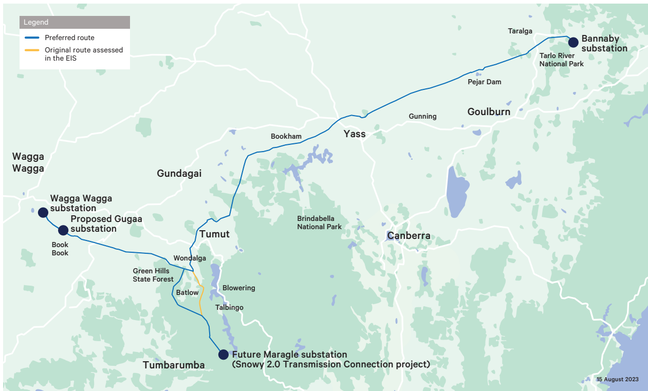
Figure 1: HumeLink preferred route.