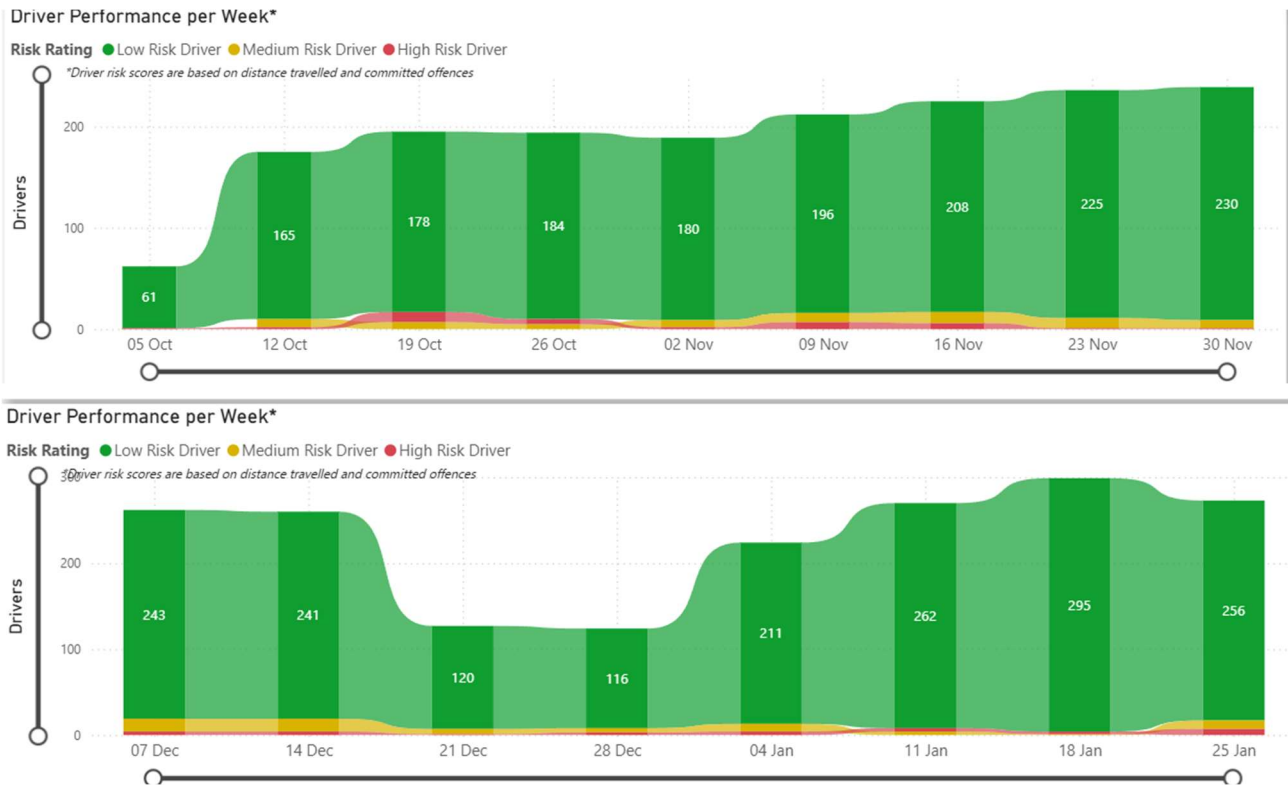
Figure 2. IVMS Driver Performance during reporting period