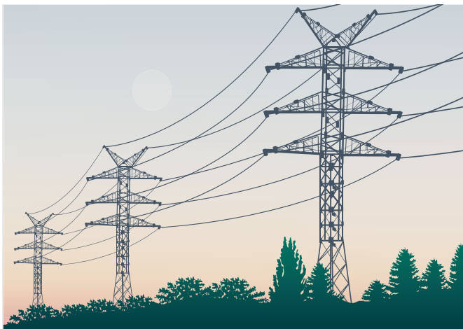
Figure 1: Maintaining electrical clearances