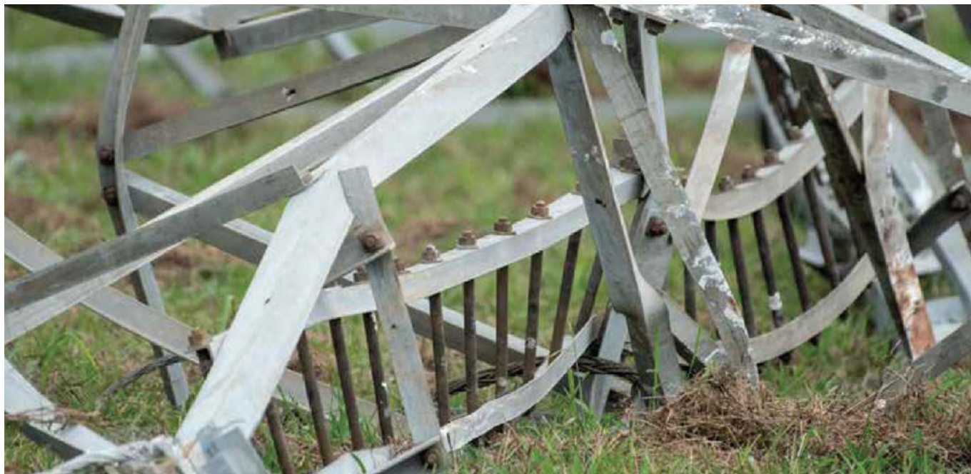
Figure 4: Transmission asset damage