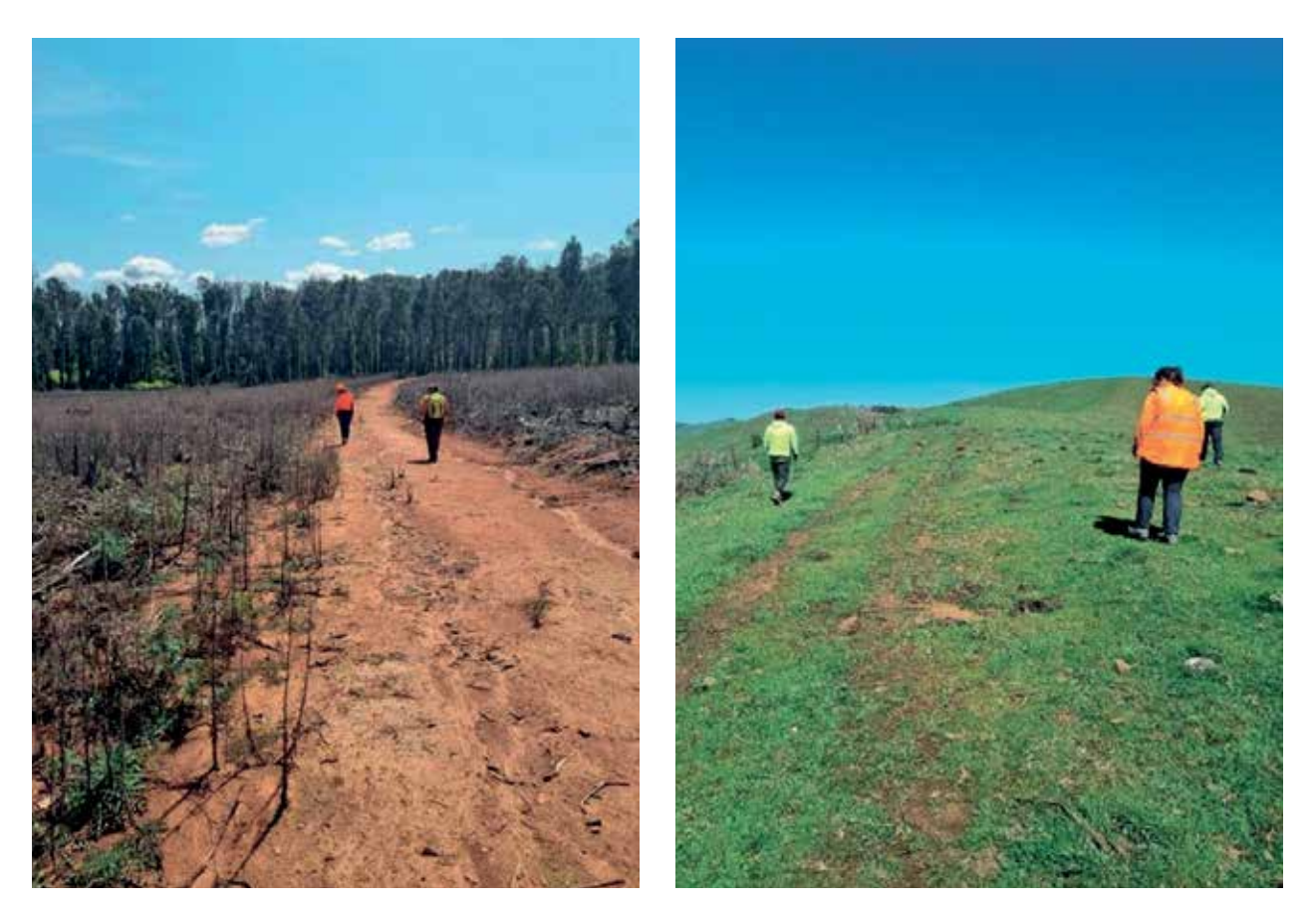
Figure 2: Our team conducting heritage surveys on foot.

Our vision is for the Aboriginal and Torres Strait Islander communities we work in to grow and achieve sustainable economic prosperity, and to see their cultural heritage and customs respected by all Australians.