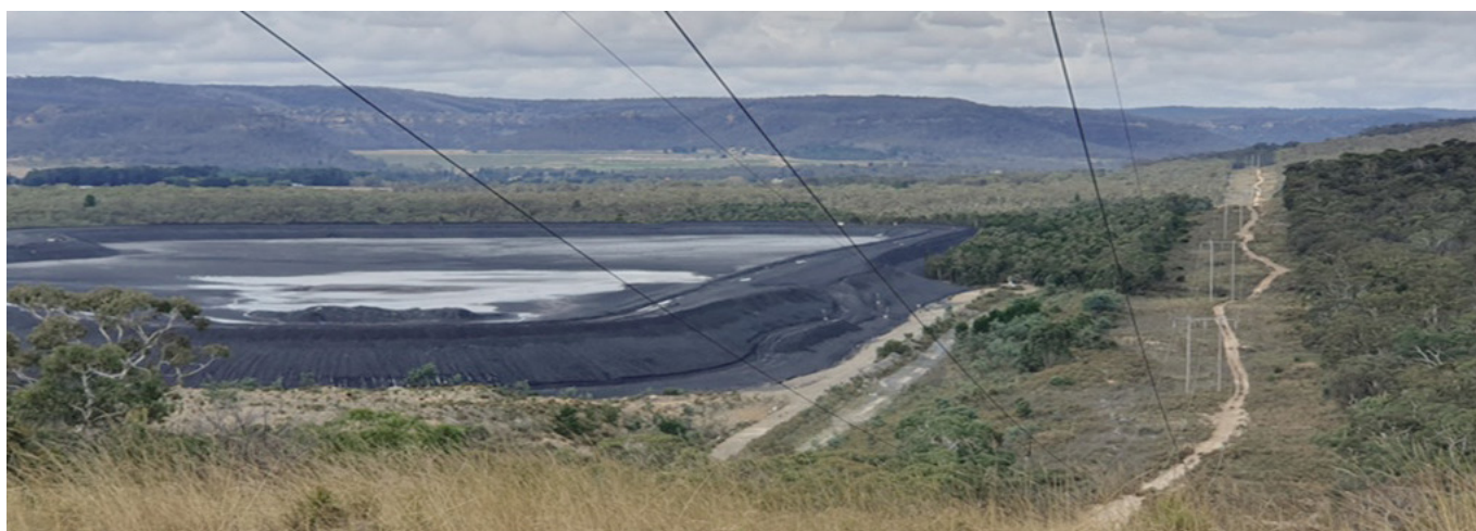
Image: Photo of current 45 m easement for 132 kV transmission line. Under the preferred route option, Transgrid is proposing to increase the width of the easement by approximately 15 m to the north (left hand side) to accommodate the new 330 kV transmission line. The 330 kV line would replace the 132 kV line shown above.

The Wallerawang and Mount Piper area (shown in the map overleaf) is located approximately 20 kilometres north-west of Lithgow on the western fringes of the Blue Mountains.