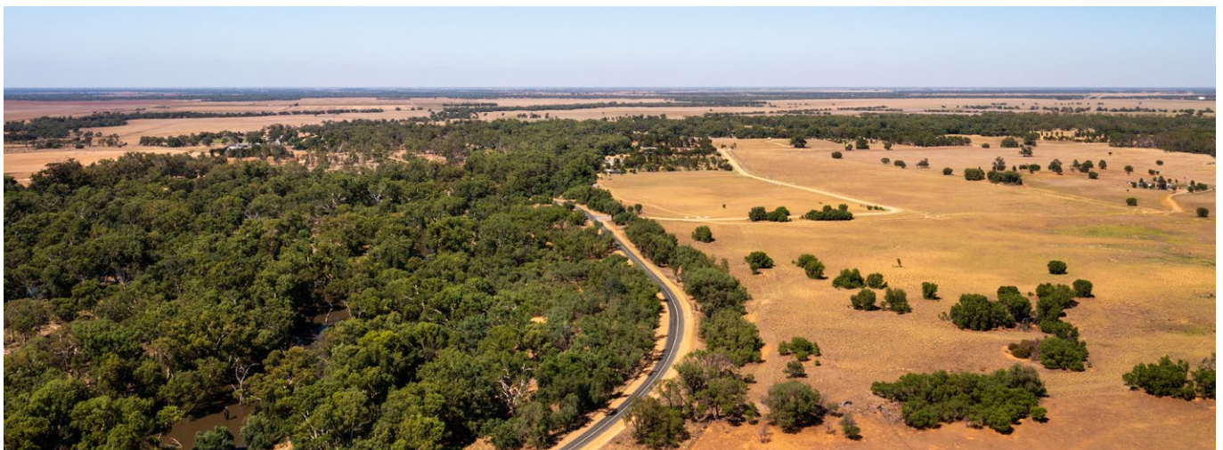
Image: Near the town of Conargo, located around 18 kilometers from the proposed transmission line.